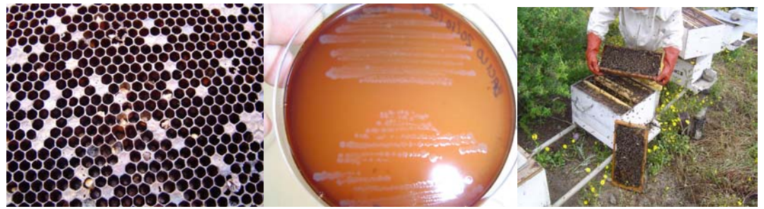
Fig 7. Putrid and Chalk Mummies Brood.

In the cases of treated hives with horizontal variant, 1 BOX HIVES (5 FRAMES OF BEES) and BABYS (3 FRAMES OF BEES), a very satisfactory evolution of this hives was observed.